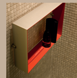
SWISS RED Designed by ZDA Zanetti Design Bathroom accessories in steel.