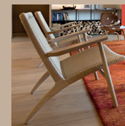
FROM SCANDINAVIA Designed by Hans J. Wegner Produced by Carl Hansen & Son (Y-CH 25 Chair model).