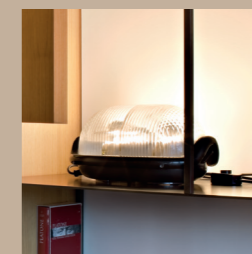
MADE IN ITALY Designed by Achille Castiglioni Produced by Flos (Noce lamp model).