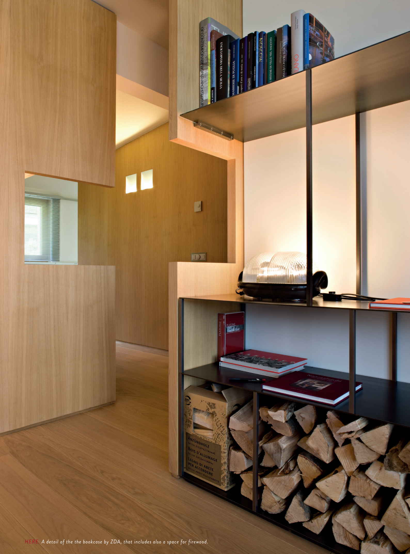
HERE. A detail of the the bookcase by ZDA, that includes also a space for firewood.