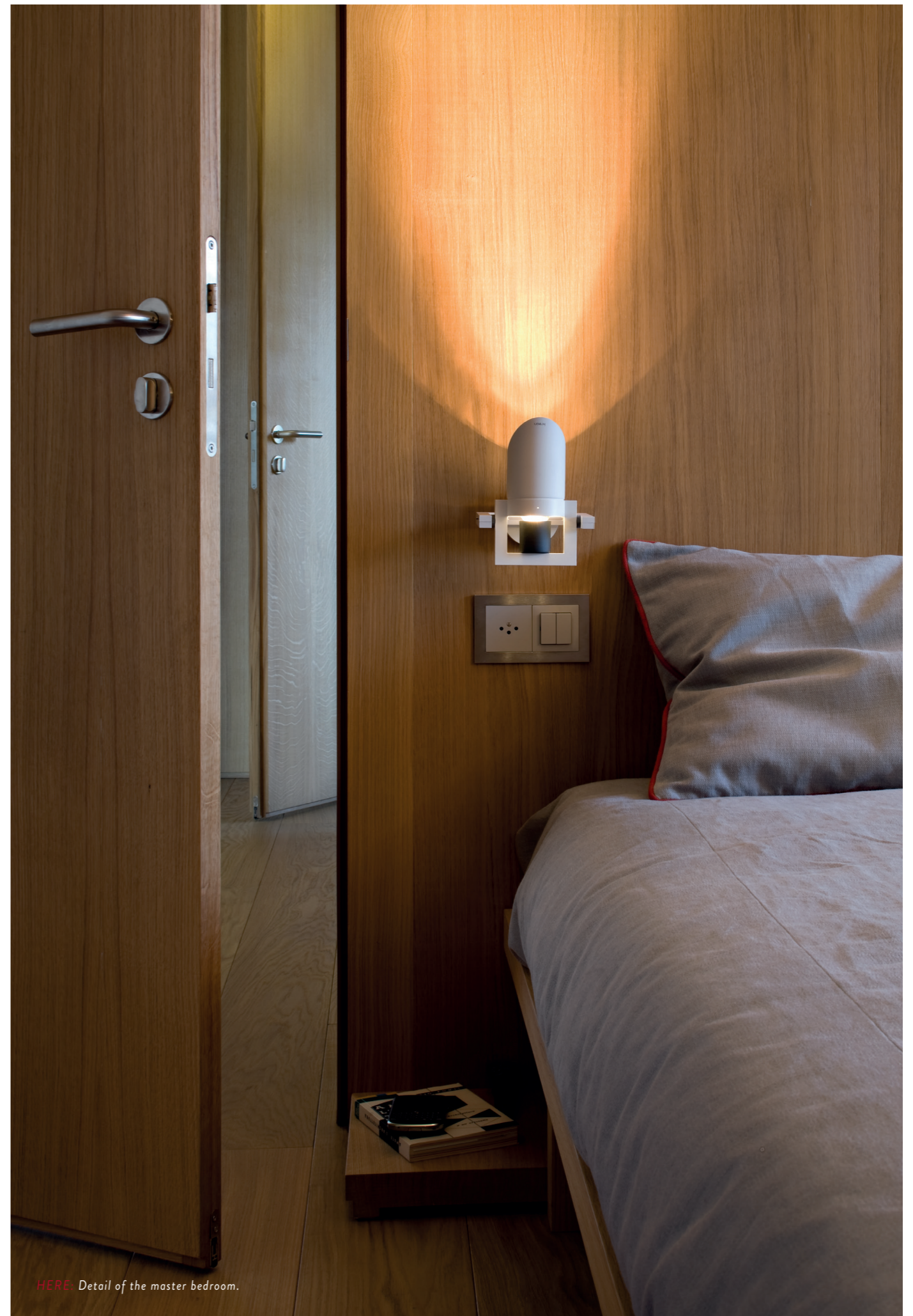
HERE. Detail of the master bedroom.